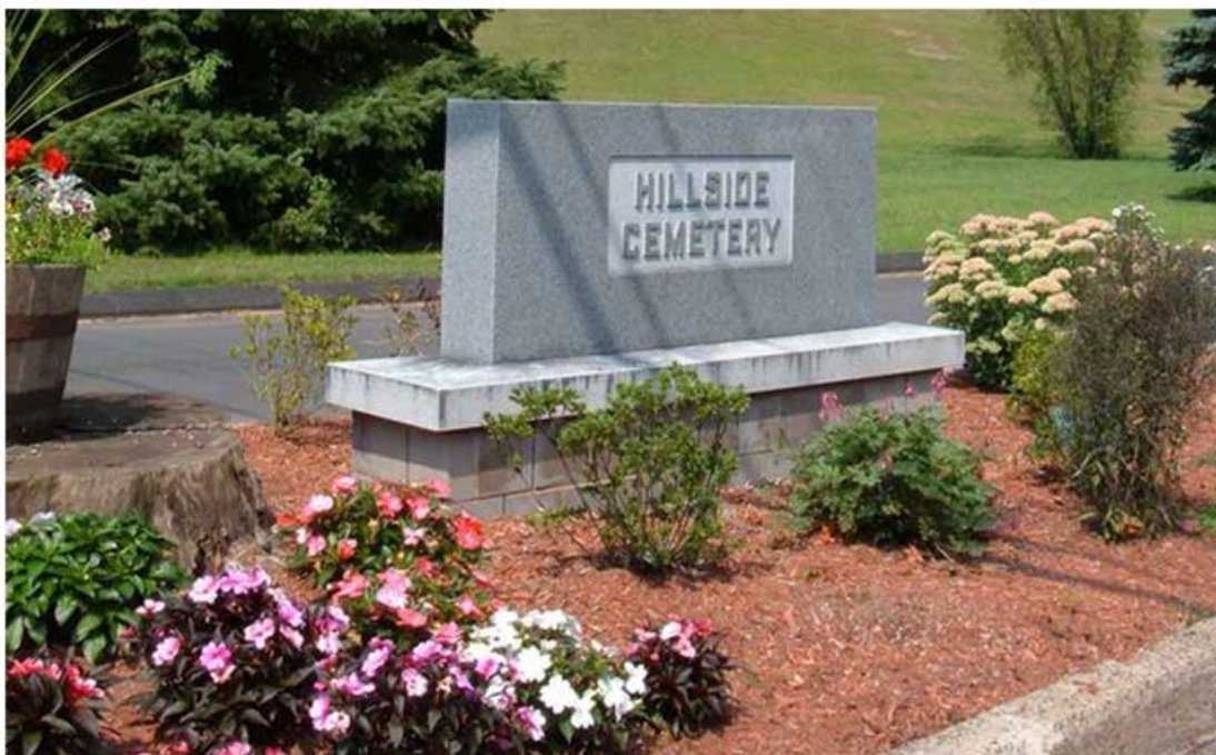
Wallingord Rd., Cheshire, CT